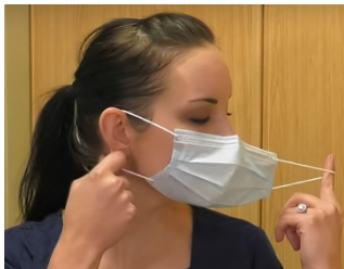
Figure 2 Don't touch the front of the mask